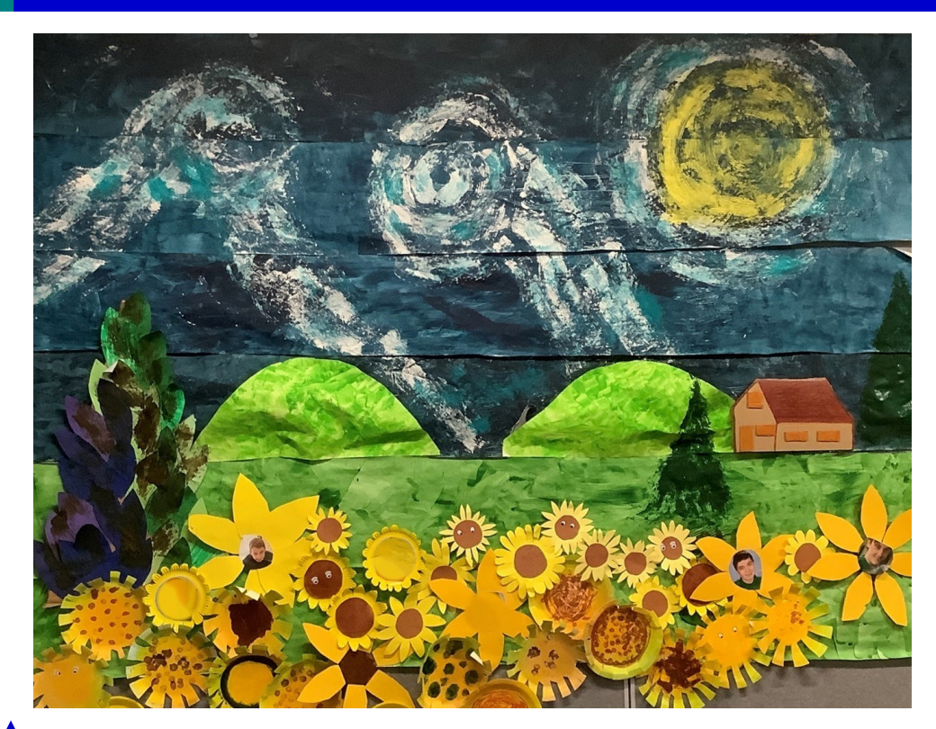
Room W2's Version of Van Gogh's Sunflower Field